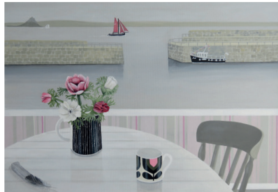
INSET The Old Coastguard