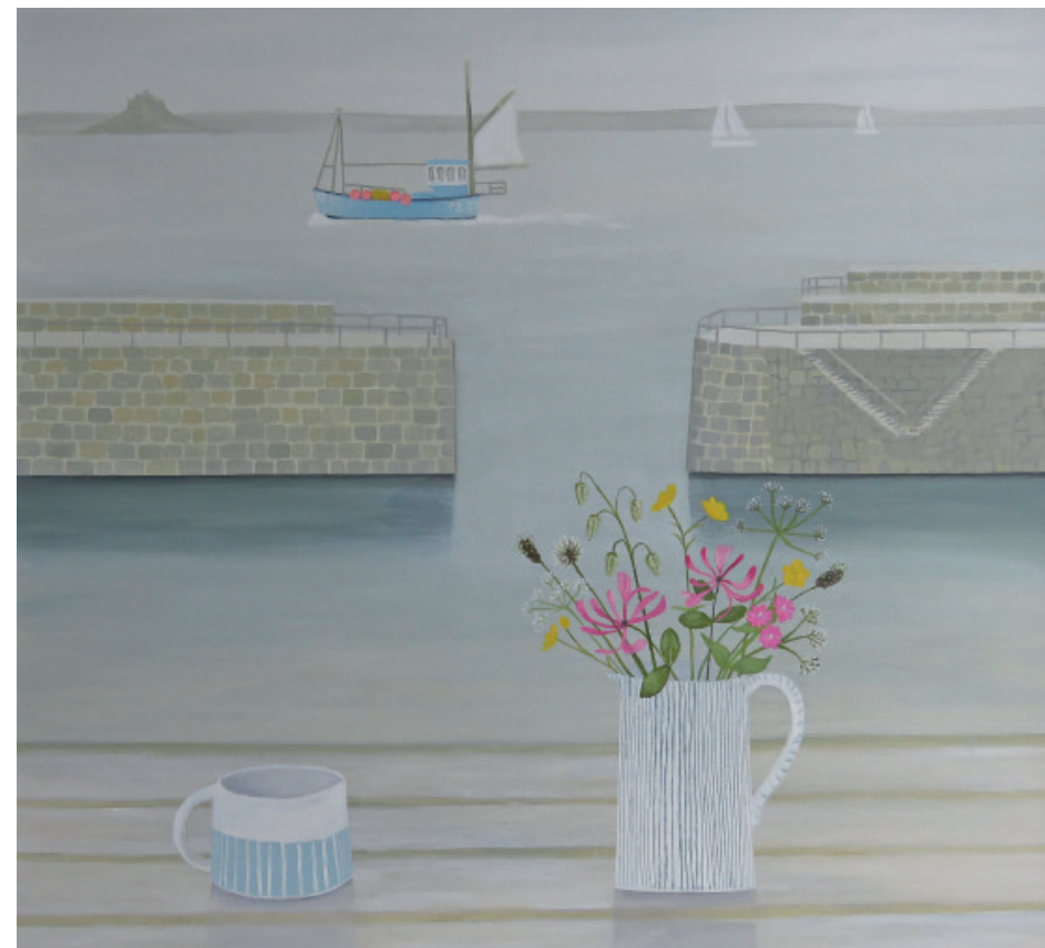
TOP Mousehole & Anemones – Gemma Pearce